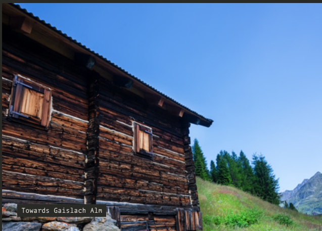
Towards Gaislach Alm